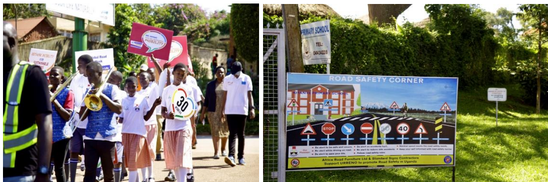
The 7 th UN Global Road Safety Week at Kitante Primary School