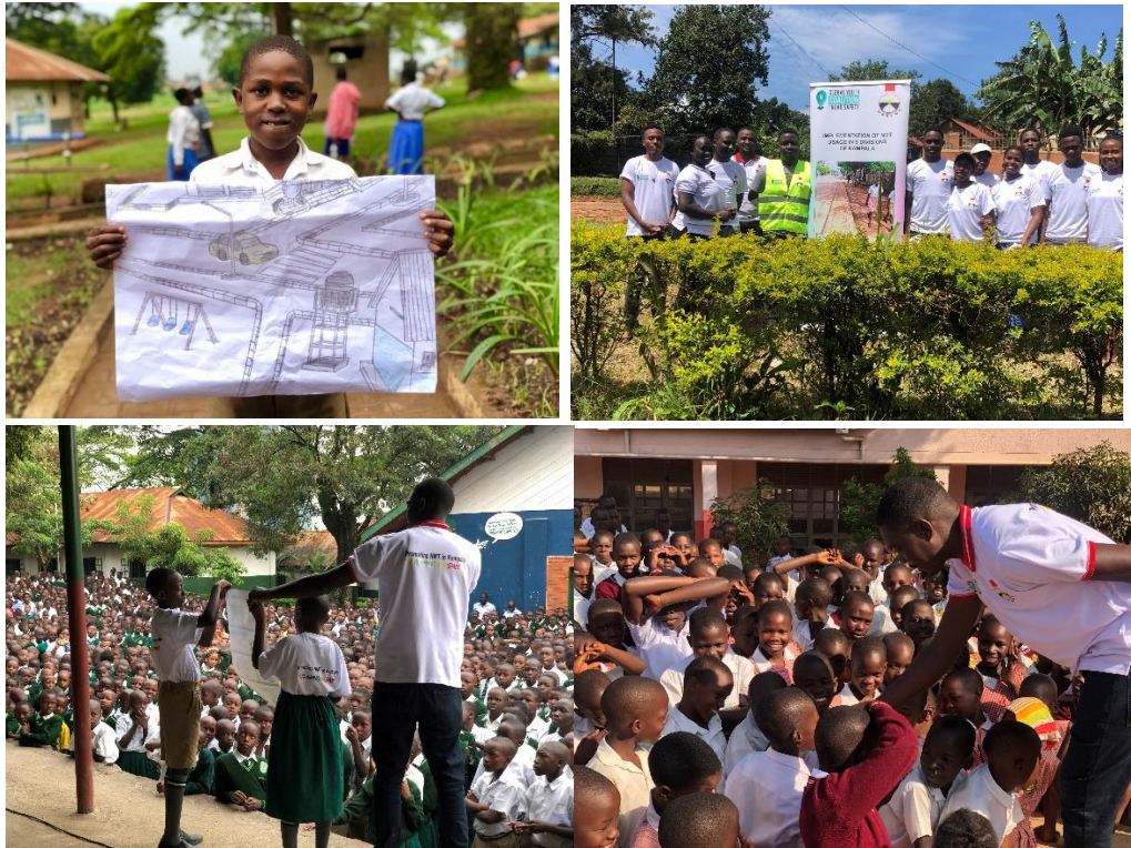
Road Safety and NMT awareness raising for schools and the youth