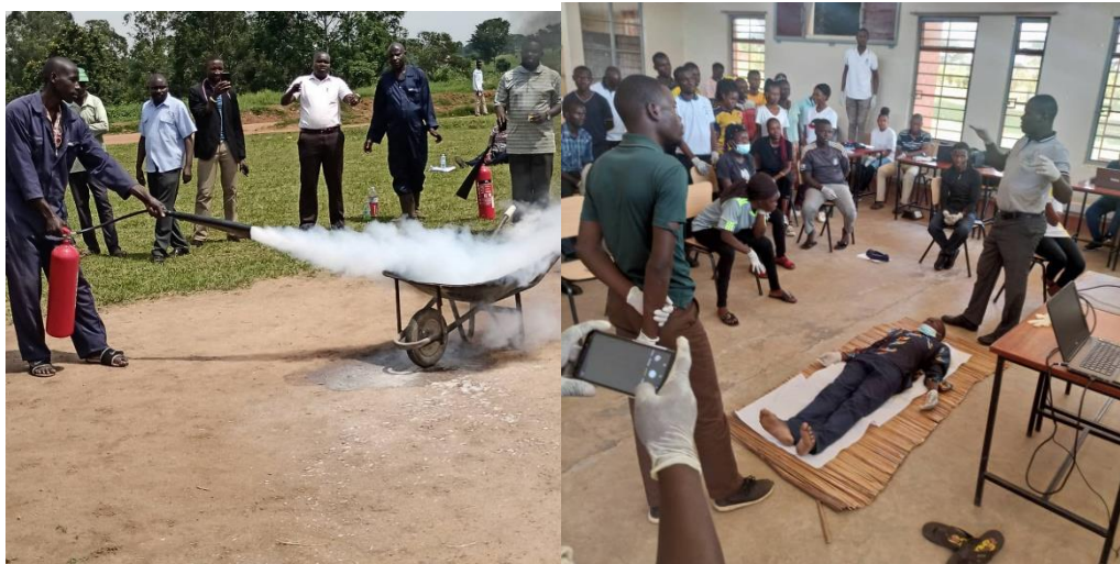
Health and Safety Training in National Teacher's Colleges